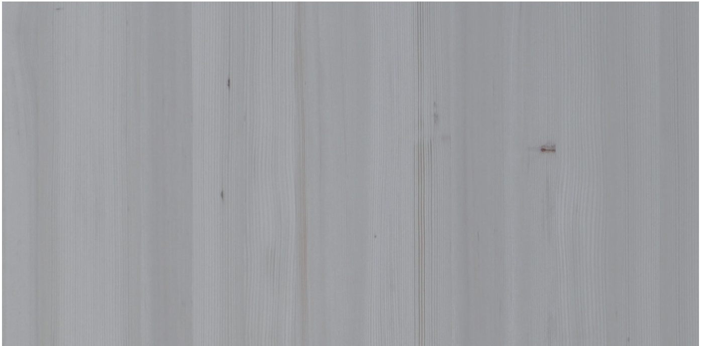
The above picture shows an example of the natural character of the wood, this will vary in every panel.

Backing C+: fir, knotholes and shakes professionally filled, twin layers not laid next to each other, no special quality specifications, finger-jointed allowed.